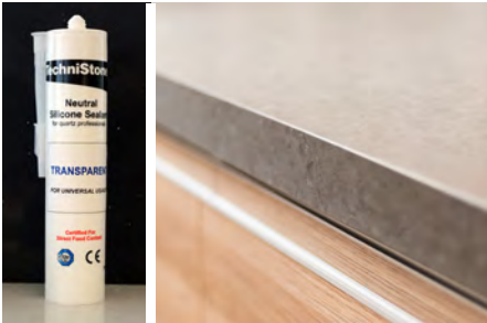
Always use neutral silicon.